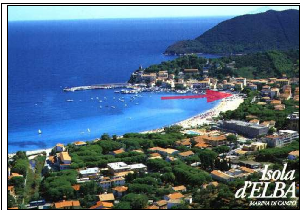
The beach of Marina di Campo, the arrow designates the Club del Mar location